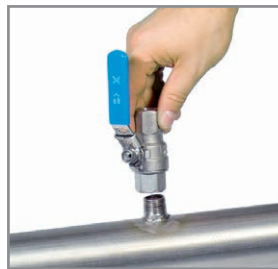
A Screw neck

By means of the drilling jig, it is possible to drill under pressure through the 1/2" ball valve into the existing pipe. The drilling chips are collected in a filter. Then install the probe as described under 1).