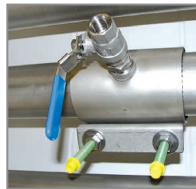
B Spot drilling collars