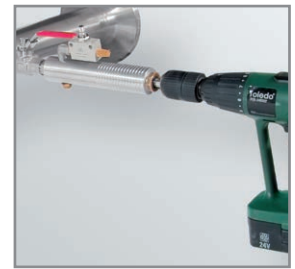
Drill under pressure with the CS drilling jig

3) Due to the large measuring range of the probe even extreme requirements to the consumption measurement (high volume flow in small pipe diameters) can be met.