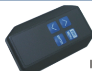
IR programmer PMT-15